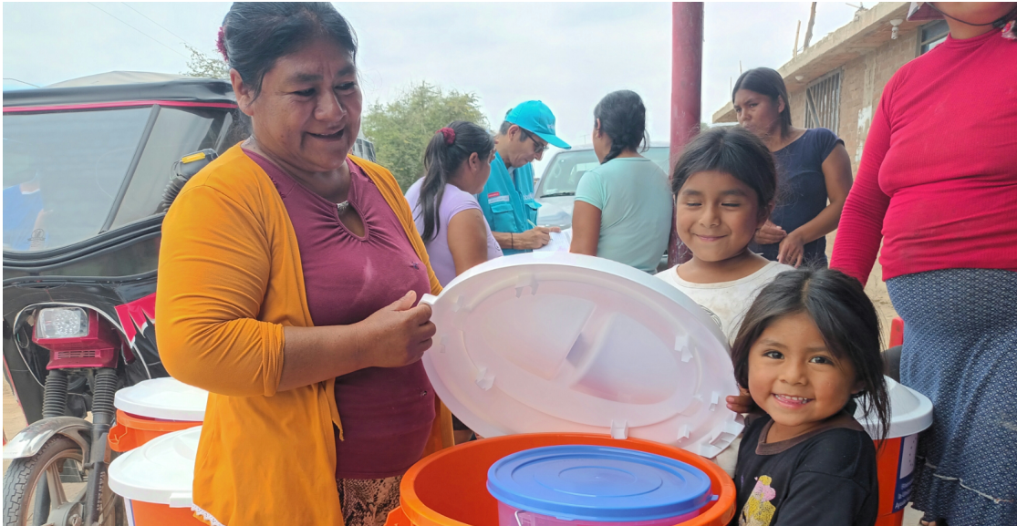
Families in Lambayeque, Peru look through the WASH items provided to them by UNICEF. The items help families cope in the aftermath of flooding caused by intense rains and Cyclone Yaku in early March 2023.