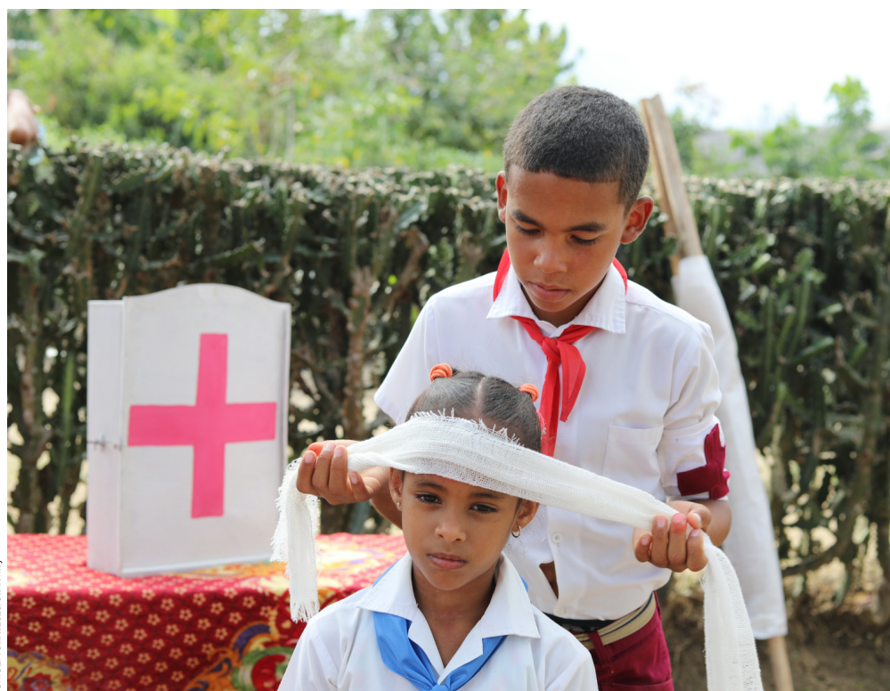
At their school in Santiago de Cuba, Cuba, children receive first aid training.

In the province of Santiago de Cuba, Cuba, 45 schools are participating in a project that focuses on building children's resilience to the negative effects of climate change and on preparing the student community to reduce the multiple risks associated with natural hazards. Through this intervention, UNICEF supports more than 4,300 children and adolescents, including 175 with disabilities, to acquire skills and participate in actions for multi-risk disaster reduction and adolescent empowerment.